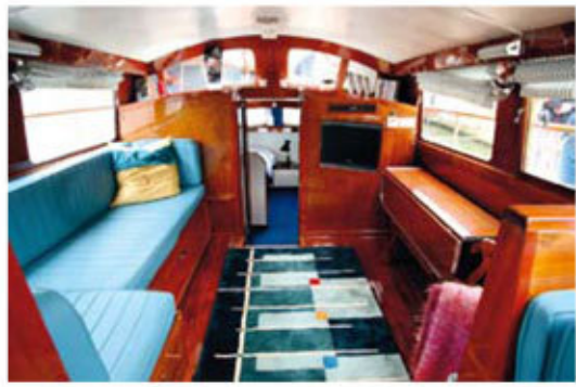
Right: The spacious saloon