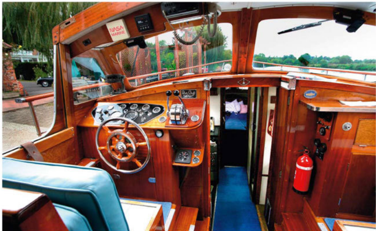
Above: The steering position: chrome dials aplenty