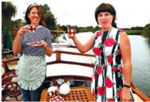
Left: Time for tea on the river