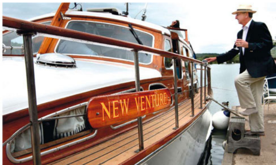
Above: Powerful and distinctive, the Bates Starcraft 40 New Venture